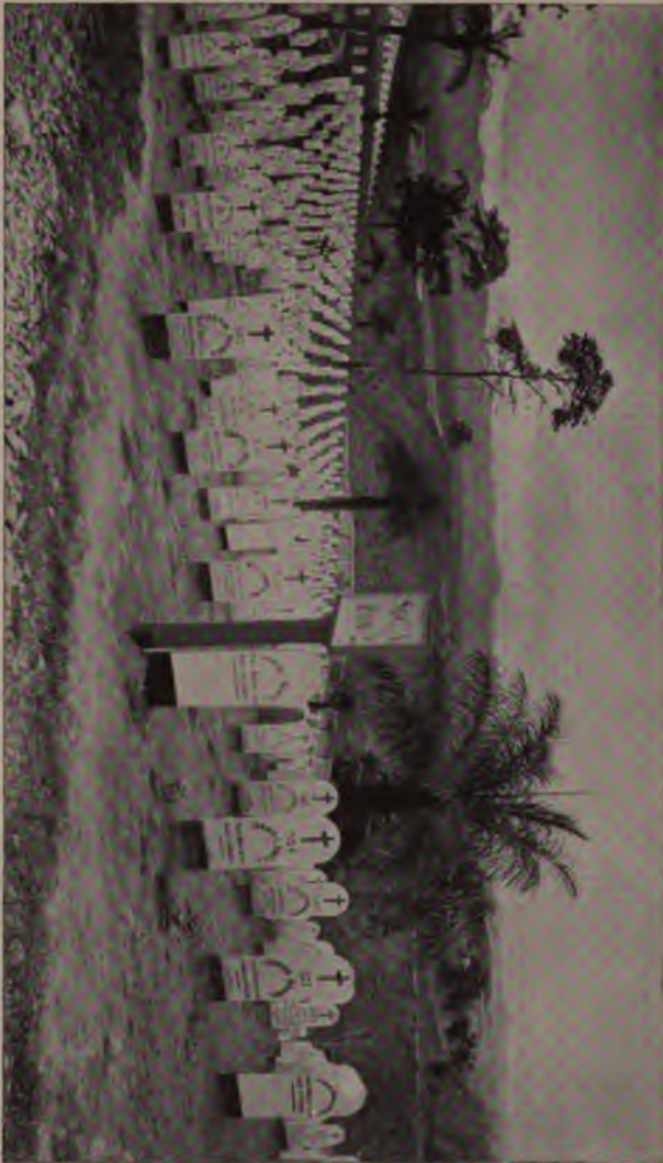
Some of the costs of the Canal